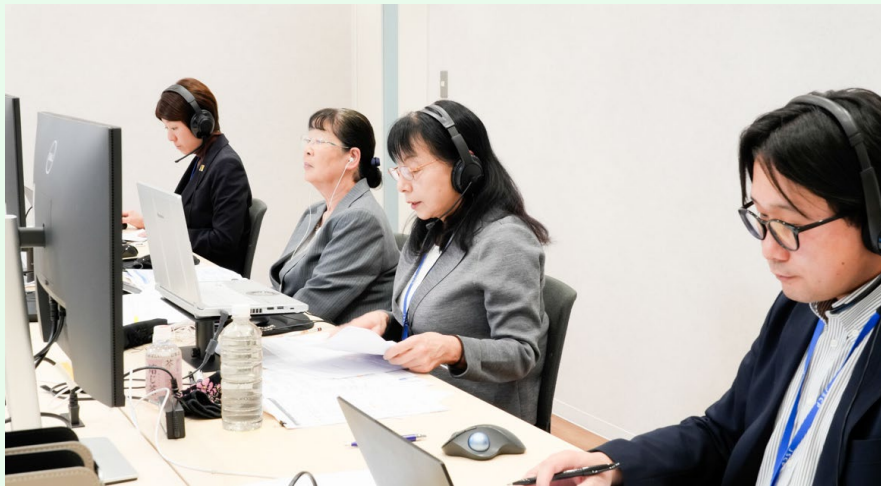
The JSCP Office during the online Zoom Concierge event

On Wednesday, July 10, 2024, JSCP, in collaboration with the Japan Association of Obstetricians and Gynecologists, prepared and published “The Crisis for Pregnant and postpartum Women Nurturing Life: The Reality of Suicide Revealed by New Suicide Statistics.” In January 2022, the items in the Suicide Statistics were revised to include items related to pregnancy and postpartum conditions. In response, the JSCP, guided by the advice of the Japan Association of Obstetricians and Gynecologists, analyzed these statistics, and the two organizations worked together to compile this as foundational information to prevent suicide among pregnant women and new mothers. Following the publication of this information, several major media outlets reported that “at least 118 women died by suicide during pregnancy or within one year of giving birth over the two-year period from 2022 to 2023.”