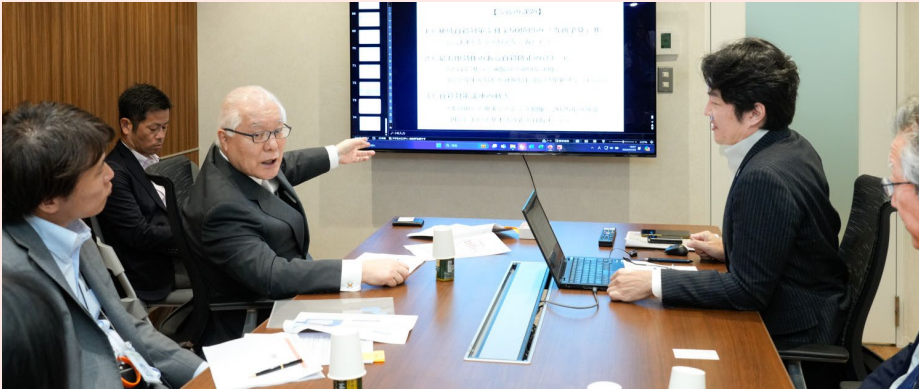
Minister Keizo Takemi shares his thoughts on suicide countermeasures

At the press conference following the visit, Minister Takemi told the accompanying reporters, “After overcoming so many obstacles over the past 20 years, it feels like we’ve finally reached this point. Since the start of operations in 2020, the JSCP system has been significantly improved, but I hope they will continue to strengthen collaborations with prefectures, municipalities, the National Police Agency, and relevant ministries. Based on this foundation, I hope they will make a substantial contribution to suicide countermeasures in our country.”