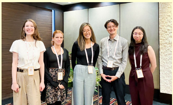
With presenters in the same sessions