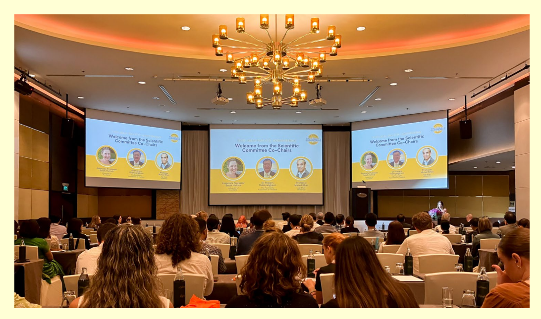
Venue: The Landmark Bangkok Hotel

The "11th IASP Asia Pacific Conference" began on June 3, 2024, and was held for four days in Bangkok, Thailand's capital. There were a total of 295 participants from 37 countries (as announced by the conference secretariat) including four members of JSCP. Participants included researchers, psychiatrists, psychologists, and educators from universities and specialty organizations, administrative staff, people directly involved in suicide countermeasures including telephone counselors, as well as media representatives and people bereaved by suicide.