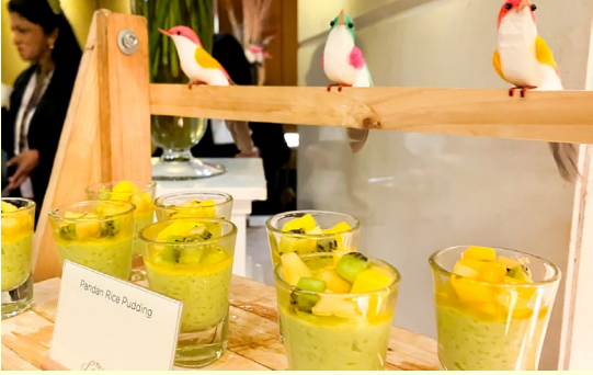
Light meals were provided to promote interaction among participants at the venue.